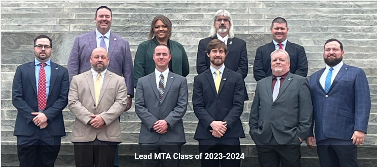
Lead MTA Class of 2023-2024

2024-2025 UPCOMING LEAD MTA APPLICATION NOW AVAILABLE